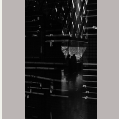
#7 The Matrix